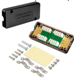
Point 1 – Scope of delivery