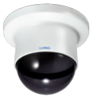
WV-QCD100G-W Dome Cover