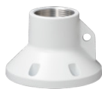
WV-QCL100-W Mount Bracket