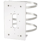
WV-QPL500-W Mount Bracket