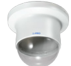
WV-QCD100C-W Dome Cover