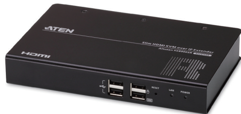
KE8900SR Front View