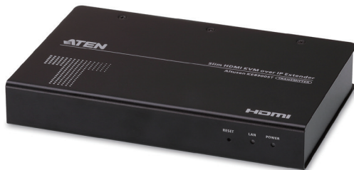
KE8900ST Front View